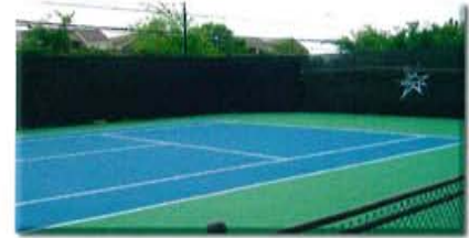
The SportMaster ProCushion System is installed on the courts at the USPTA's headquarters in Houston, TX.