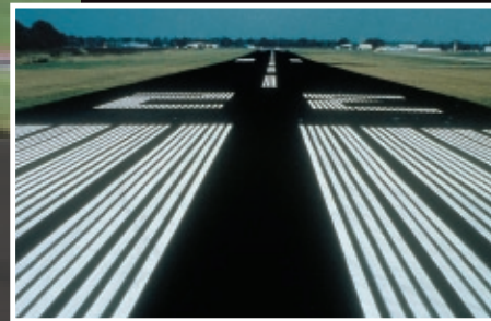
Tarconite meets and exceeds rigorous FAA requirements for airport pavements.