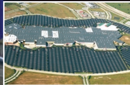
Tarconite protects for pennies a square foot, preventing costly repairs.