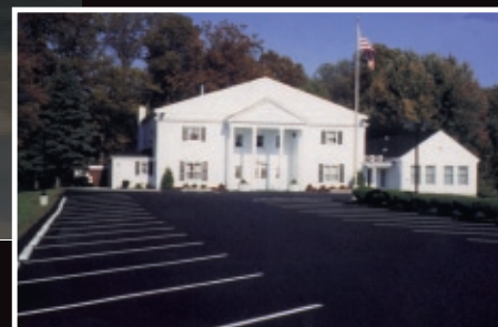
Tarconite provides up to 50% greater wear than non-fortified sealers, making it ideal for high-traffic areas.

Tarconite preserves asphalt pavement with a deep, rich, black seal that beautifies and protects.